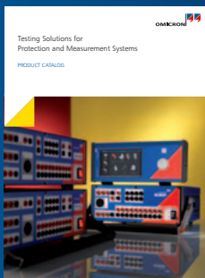
Product catalog (secondary equipment)

The following publications provide detailed information on the products described in this brochure and their applications: