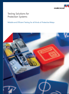
Testing Solutions for Protection Systems

For a complete list of available literature please visit our website.