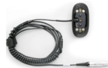
SV 105A / SV 105AF